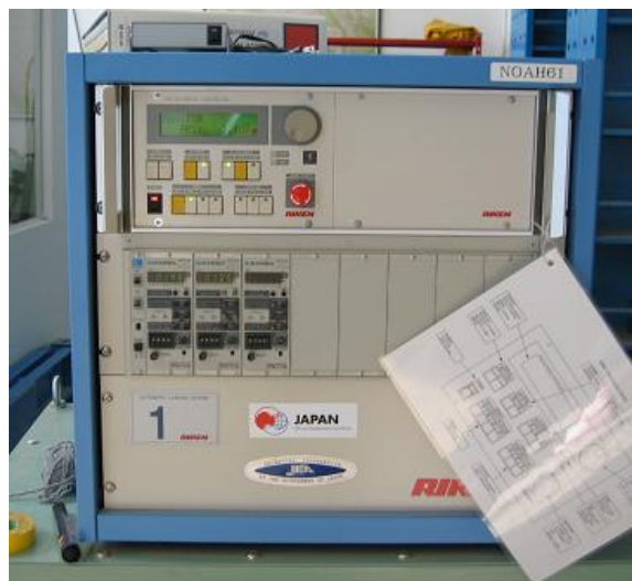
Automatic loading system (by RIKEN Japan)

One vertical jack with capacity of 200 tons and two horizontal jacks of 100 tons capacity each form the loading system.